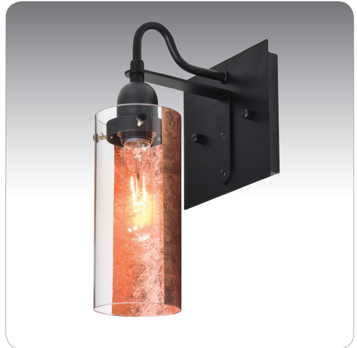
COPPER FOIL (DUKECF)

UL or ETL Listed. Suitable for Damp Locations (interior use only).